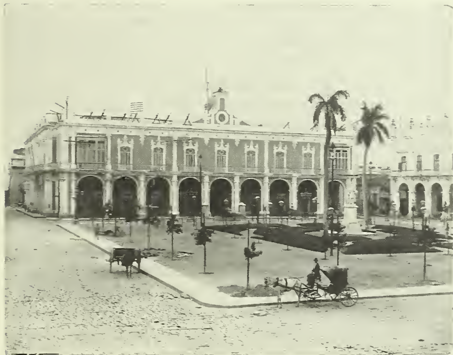
FIGURE P.2 • Palace of the Captain General, Havana, ca. 1895.

Fernando Ortiz would eventually dismiss the far-fetched theory as an old man’s prejudices, although he still observed that the captain general “looked and he seemed to me somewhat like a light-skinned mulatto.” In the same chamber after Cuban independence, Ortiz recounted this anecdote to Tomás Estrada Palma, the first president of the Cuban Republic (see figure P.2). Estrada Palma dismissed with “unforgettable amiability” the story about his colonial predecessor: “Now all that has finished; in Free Cuba we are now all of the same color.” 5 And this was the idea that Ortiz reiterated in a speech delivered in that very same space (in what was now the Municipal Palace) in 1943.